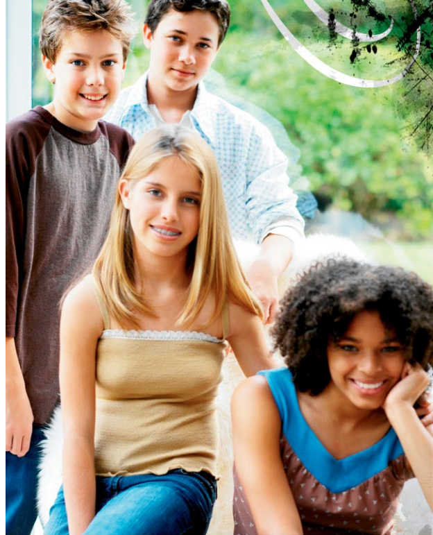
ARE YOU ITK?